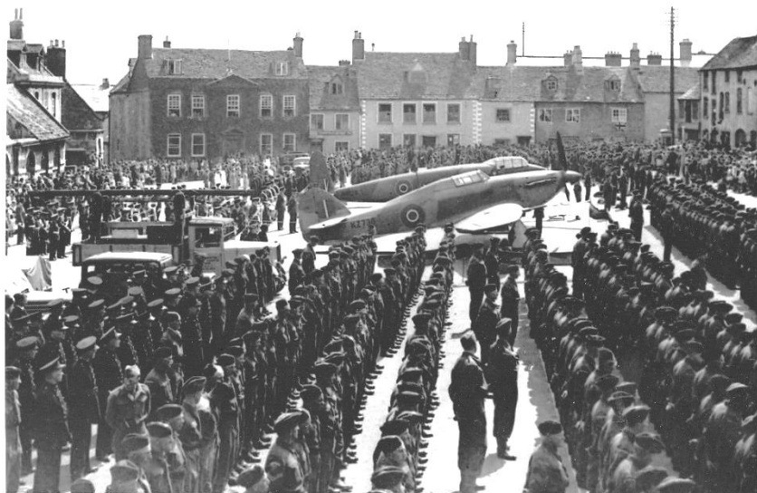
Photograph of the 'Wings for Victory' event on May 15th 1943.

Work is well underway on our forthcoming exhibition to commemorate the 80th anniversary of the end of World War Two. It will take place from Tuesday 30th September 2025 in the museum and will include exhibits and information boards on many aspects of the war, focussing on everyday life in wartime Malmesbury.